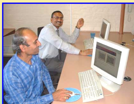
Members of SKS Swaminarayan Temple East London testing the Shikshapatri website