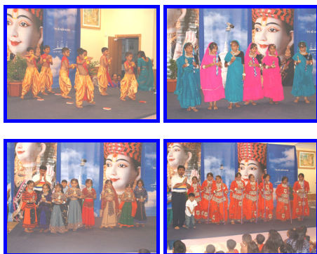
Pictures above and right describe the planning and eagerness of youths.